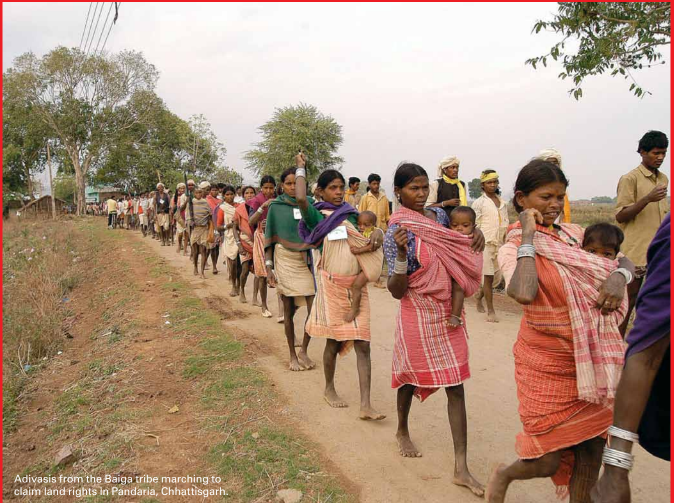
Adivasis from the Baiga tribe marching to claim land rights in Pandaria, Chhattisgarh.